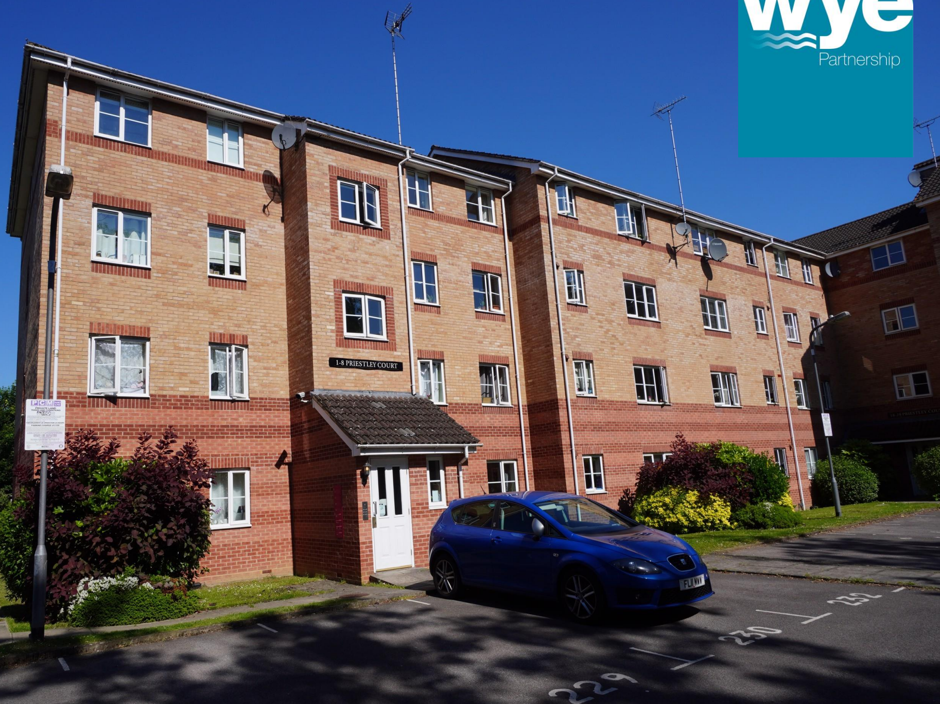
Princes Gate, High Wycombe, Buckinghamshire, HP13 7WZ